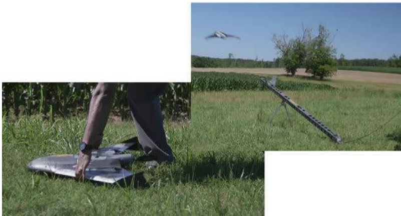
Figure 2 - Launch and Recovery

Since the FAA governs all aspects of airborne flight, the North Carolina General Assembly chose to allow local governments and private property owners to limit the use of UAS on their property. The law requires consent when on state or private property prior to UAS launch and recovery. However, this consent does not waive any other FAA requirements once the UAS is airborne.