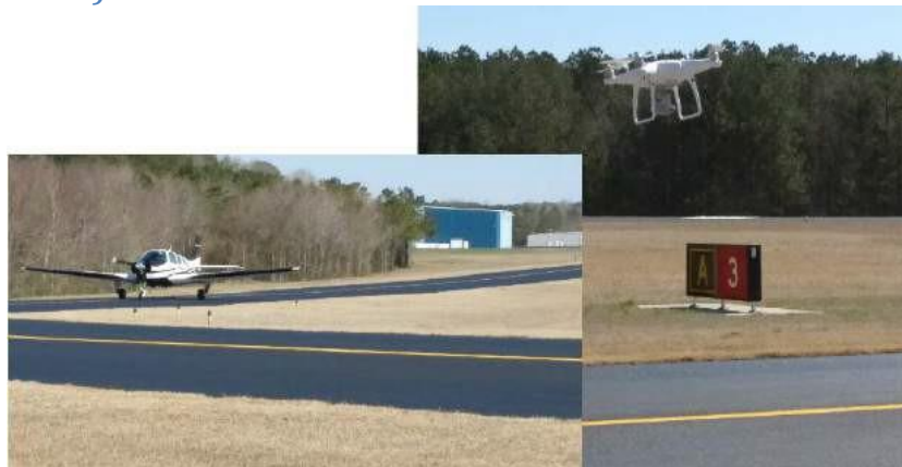
Figure 7 - Interference with Manned Operations

Per NCGS 14-280.3, it is a felony to willfully damage, disrupt the operation of, or otherwise interfere with a manned aircraft through use of a UAS while the manned aircraft is taking off,