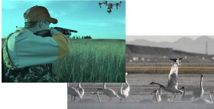
Figure 9 - Interfere with Wildlife Resources

Per NCGS 113-295, it is a misdemeanor for a UAS operator to intentionally interfere with lawful hunting or fishing or to drive, harass, or intentionally disturb wildlife in order to disrupt lawful hunting or fishing. It is also illegal to take or abuse property, equipment, or hunting dogs that are being used for lawful hunting or fishing.