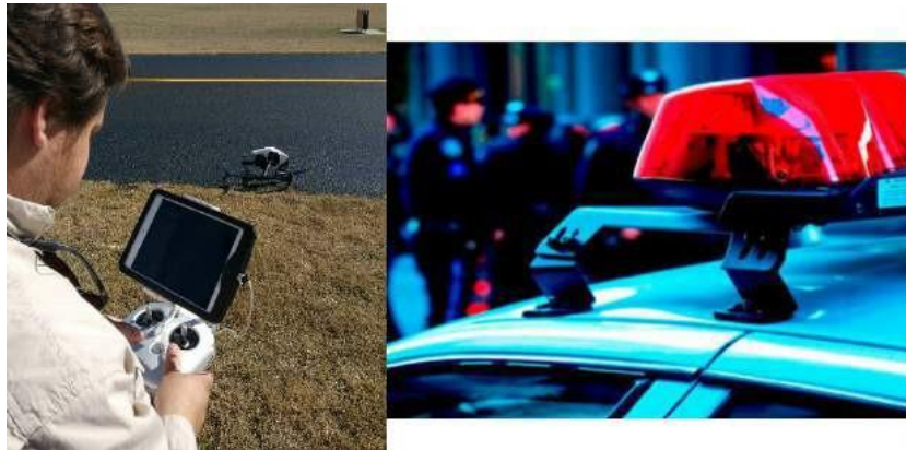
Figure 4 - Law Enforcement

UAS used by North Carolina law enforcement agencies of the state or a political subdivision of the state are allowed in the following instances: