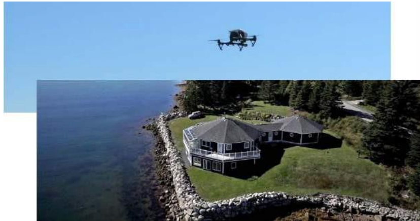
Figure 3 – Property Surveillance

It is illegal to operate a UAS in North Carolina to conduct surveillance of a person or a dwelling occupied by a person without the person's consent. This includes the house or dwelling and the land immediately surrounding it. It also includes the boundary where a homeowner can have a reasonable expectation of privacy. These limitations also extend to surveillance of private property (lands and fields) without the consent of the owner, easement holder, or property lessee.