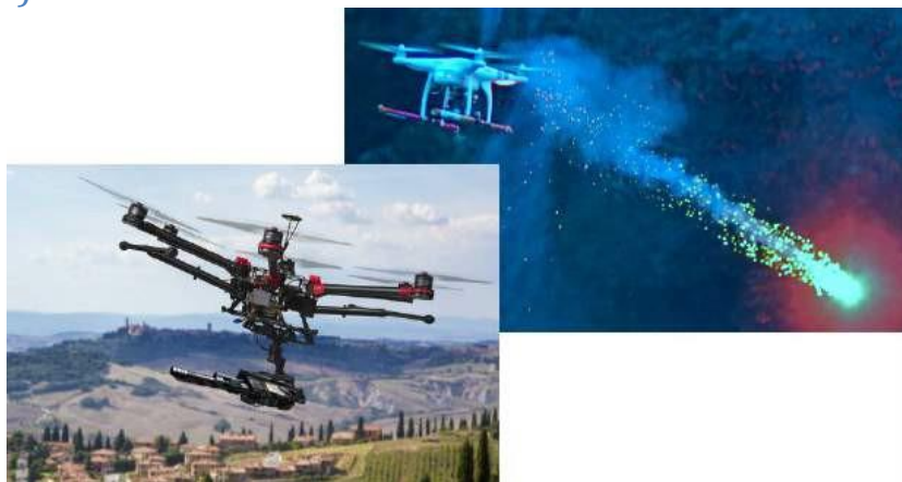
Figure 8 - Unlawful use of UAS

Per NCGS 14-401.24, it is a felony to possess or use a UAS that has a weapon attached to it.